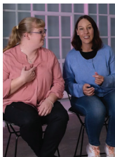
Cervical cancer screening