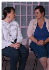
Breast cancer screening